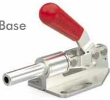
609 Flanged Base